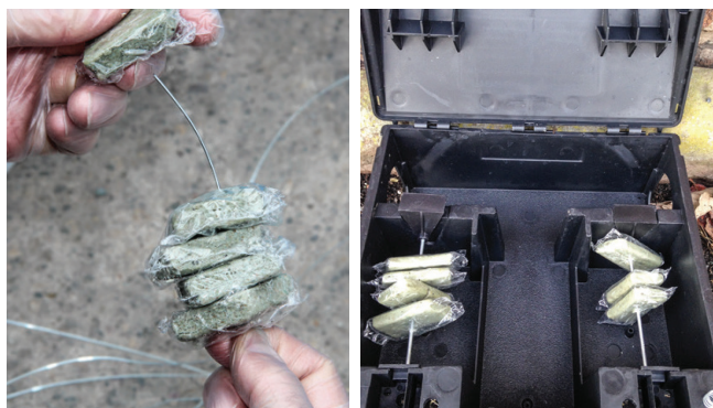
Above: For best results, place Selontra® at covered bait points, in burrows or in bait boxes throughout the infested area. Please refer to the approved product label for specific use information.

Bait may only have to be placed for seven days to achieve control provided that sufficient bait for the size of the infestation is placed on day 1 of the treatment. To ensure that sufficient bait has been placed for the size of the infestation it is recommended to inspect baits 1-2 days after the first bait placement. If a bait point is completely consumed, double the amount of bait at that bait point. This will ensure optimum control in the shortest time is achieved. Inspect baits regularly. Note that if insufficient amount of bait is used at any time of the treatment, this may lead to sub-optimal results. If bait uptake should continue for longer than a week, continue placing bait every seven days until consumption ceases. When the uptake of bait has stopped, the remaining bait should be collected and disposed of safely.