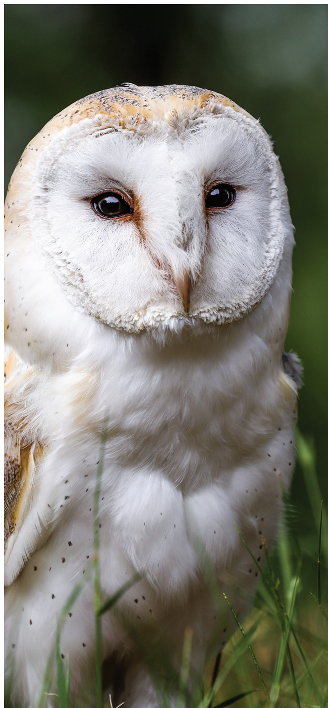
Above: Selontra® poses a lower risk of secondary poisoning to birds of prey such as barn owls.