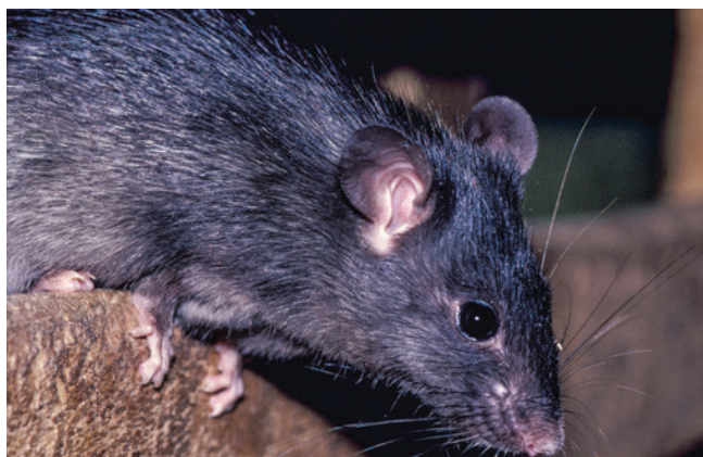
Right: Selontra® quickly and effectively controls key target rodents including the house mouse, Norway rat and black rat.