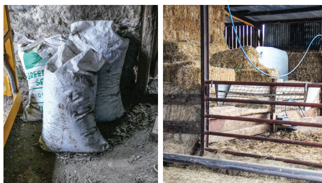
Above: Inspect areas of harbourage for rodents such as stacks of straw bales and feed bags. Practicing good hygiene such as removing rubbish and other food sources will help control rodent infestations.

For these reasons, there is very limited likelihood of resistance developing.